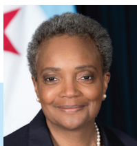
Lori E. Lightfoot Mayor City of Chicago