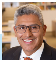
Juan Salgado Chancellor City Colleges of Chicago